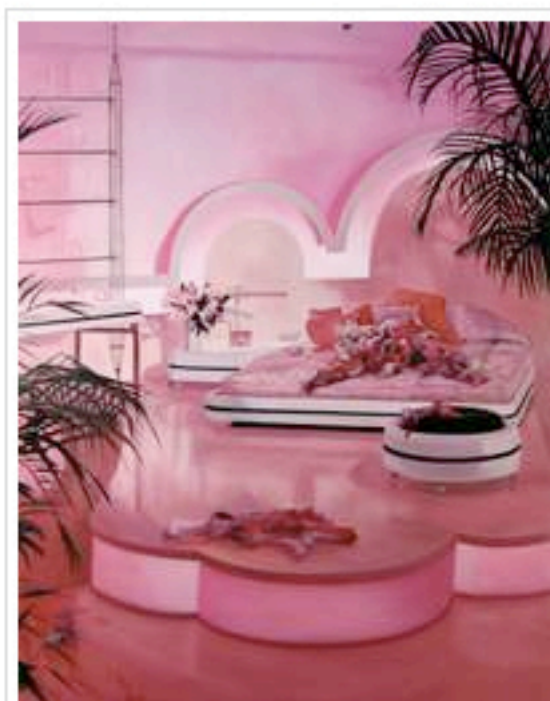
Rives Granade: Pink Room .